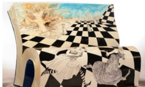
Books About Town, London, UK