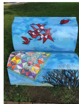
Lexington Book Bench Project, Lexington, KY