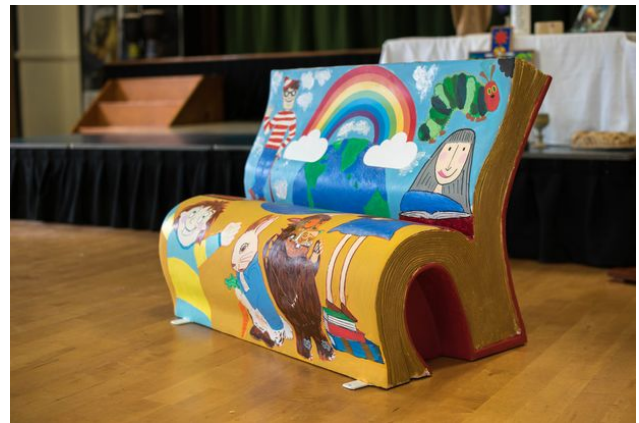
The BookBench Project, Birmingham, UK

City of Montgomery Public Art Commission does not discriminate on the basis of race, color, religion (creed), gender, gender expression, age, national origin (ancestry), disability, marital status, sexual orientation, or military status, in any of its activities or selection of artists.